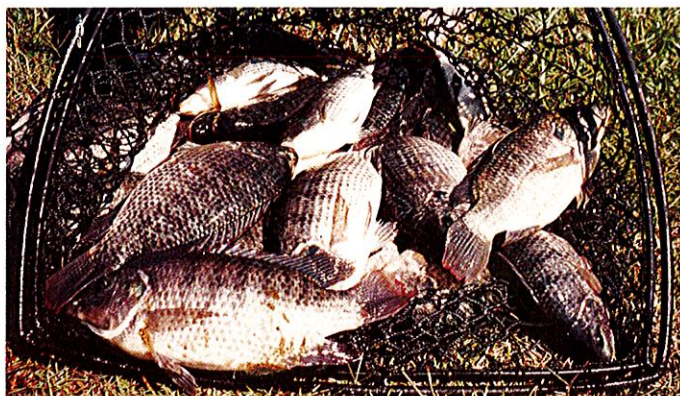
FIGURE 3. Tilapia are a popular culture species particularly in aquaponic systems. They are tropical animals and must have water temperatures above 48°-52°F to survive.

costs in indoor tank systems are relatively high. While there has been a growing market for tilapia fillets, foreign farms are able to produce, process and ship fish to the United States at a lower cost than can be achieved by domestic tilapia producers. Producers in the U.S. are limited primarily to supplying live tilapia to niche markets, such as ethnic grocery stores. Tilapia are an excellent fish for hobby or home food production and are widely used in high school aquaculture programs.