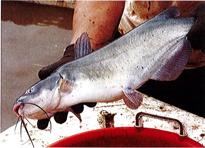
FIGURE 1. Arkansas is the third largest producer of farmed-raised channel catfish. Most catfish production in Arkansas is in earthen ponds.