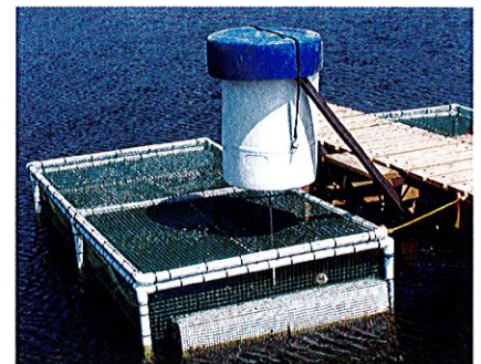
FIGURE 11. Cages are a great way to raise fish for home consumption.

Cages – Cage culture is an option where existing ponds have irregular bottoms and stumps or trees that prevent harvesting fish with a seine, as in commercial ponds (Figure 11). In general, costs of production (per pound) are higher for raising fish in cages than in open ponds. However, cages provide an excellent way to raise small quantities of fish and to keep them readily accessible for harvest. In fact, fish can perhaps be too accessible in some cases because poaching is a major problem in cage culture. SRAC 0160 through 0170 provide detailed information on various aspects of cage culture, including suitable species, cage design and construction, siting, management and problems.