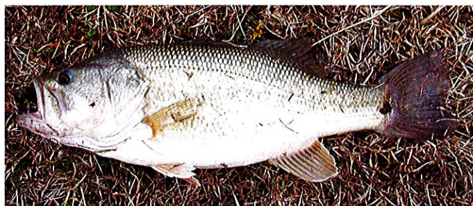
FIGURE 4. Largemouth bass are the most sought-after sportfish in America.

Other Food Fish Species – Hybrid striped bass are an excellent food fish and are raised in several other states and countries for the food fish market. Arkansas is a leader in the production of hybrid striped bass fingerlings, but there is very limited production of hybrid striped bass as a food fish in the state. Information is available on culture methods (see SRAC 0301, 0302 and 0303), but marketing is likely to be a challenge. Typically, hybrid striped bass are sold whole, on ice, to restaurants. No processing is available, and this limits production. Another food fish species is the largemouth bass. Largemouth bass (Figure 4) as small fingerlings can be brought into tanks and trained to eat pelleted feeds (see SRAC 0201). This is a demanding process, but once the fish learn to accept feed pellets, they can be raised for the live food fish market. Largemouth bass diets are different from those for catfish, and in general, culture methods are relatively demanding. Hybrid bream are also a potential food fish species, but grow relatively slowly compared to catfish and will likely require at least two growing seasons to reach a minimally acceptable market size (see SRAC 7205). There are no commercial hybrid bream food fish producers in the state, and the economics and marketing have