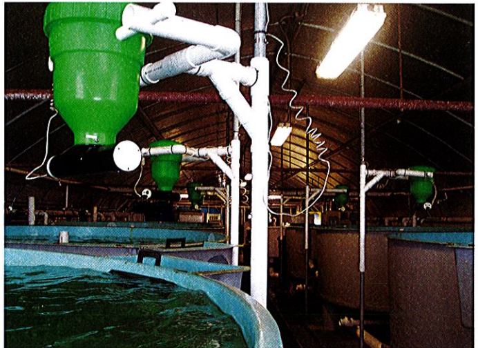
FIGURE 9. Recirculating systems require careful attention.

A recirculating system typically consists of a culture tank, where the organisms are held and fed; a solids collection device; and a biofilter, where a film of bacteria growing on a substrate (selected for its large surface area to volume ratio) breaks down nitrogenous wastes into relatively non-toxic forms (Figure 9). A small pump is used to circulate water through the various components, and an air blower is used to add oxygen to the water. The simplest form of a recirculating system is the home aquarium – the gravel on the tank bottom as well as substrate in the filter serves as a biofilter. Commercial recirculating systems are more intensive and produce a greater weight of fish per unit volume. Additional components such as protein skimmers, micro-screens (to remove small particles) and liquid oxygen systems may be used.