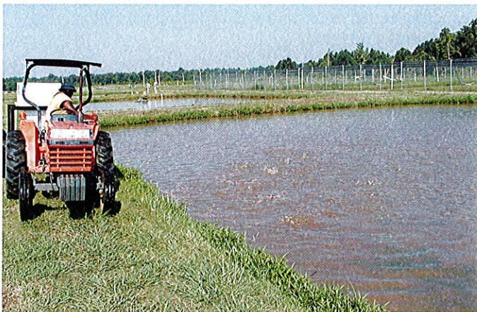
FIGURE 8. Earthen ponds are the most common culture system.

Ponds – Pond culture is a known and proven technology. Ponds naturally process fish waste products, and successive crops of fish can be raised in the same water without draining or water exchange. Compared to other culture systems, fish densities are relatively low. Worldwide and in the United States, most of the fish and shrimp produced through aquaculture are cultured in ponds (Figure 8). Arkansas has large areas of flat land with soils suitable for levee ponds. For information on commercial levee pond site selection and construction, see SRAC 0100 and 0101. Several catfish producers have installed split-pond production systems, where fish are raised in a smaller section of the pond (15-20 percent of pond area) and water is circulated daily through the remaining pond area. Preliminary results indicate that split-pond systems may double yields, although total costs are also higher.