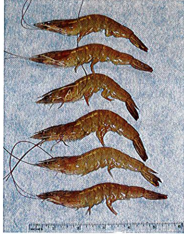
FIGURE 6. Marine shrimp raised in freshwater ponds, Pine Bluff, Arkansas.

below 59°F). Because of competition from wild-caught and imported shrimp, and seasonal production, marketing is a major concern for inland shrimp farmers. It is essential that the post-larval shrimp be obtained from a reputable hatchery, that they be specific pathogen free (SPF) and inspected to ensure they are free of viral diseases. While post-larval shrimp are widely available, there is limited availability of quality product.