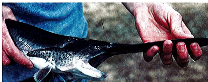
FIGURE 5. Paddlefish are not a common culture species, but they can be raised at low densities in reservoirs.

not been studied. Crappie (black or white, or the hybrid) are species that have been proposed as a potential food fish, primarily because they are considered “good eating.” While there has been some research on crappie culture, much remains to be learned before commercial culture of this relatively delicate and demanding species becomes a reality. Paddlefish (Figure 5) (see SRAC 437), buffalo (see SRAC 723) and grass carp are examples of species that can be raised in polyculture with catfish or in extensive culture (fertile reservoirs).