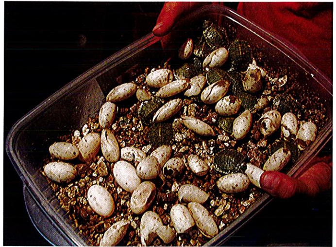
FIGURE 7. Arkansas has several turtle farms, but little research-based information is available on culture and marketing.

Turtles – Several species of aquatic turtles are produced in Arkansas (Figure 7). Only a limited amount of research has been done on turtle culture, and current operations have developed many of their own techniques. Small hatchlings are sold as pets (see SRAC 0439), but due to regulations and health