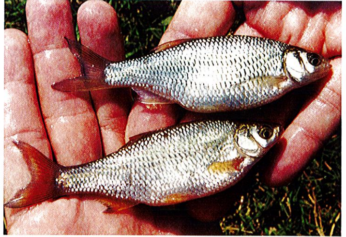
FIGURE 2. Golden shiners are baitfish that are farm-raised in Arkansas.

(see SRAC 1800) and lower for larger farms, at least 320 acres or more. Large farms typically sell fish to catfish processors while farms of less than 20 acres should consider marketing fish locally through direct sales (see SRAC 0350). Fee fishing operations (pay lakes) and fishing leases provide additional income opportunities (see SRAC 0479a, 0480-0482). Catfish is a high-quality, desirable product (see SRAC 0501), but sales have been hurt by imports of competing fish species from countries with few environmental and regulatory controls.